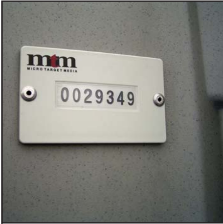
RFID Inventory Tag