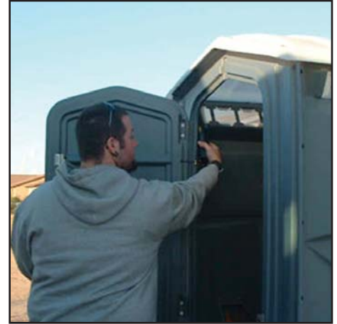
SPUD Scanning Unit