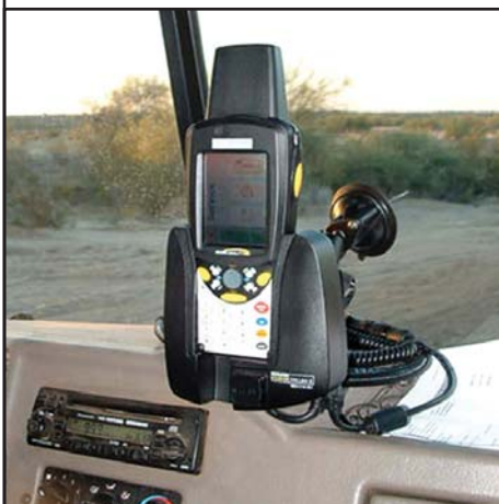
SPUD Device on truck dashboard